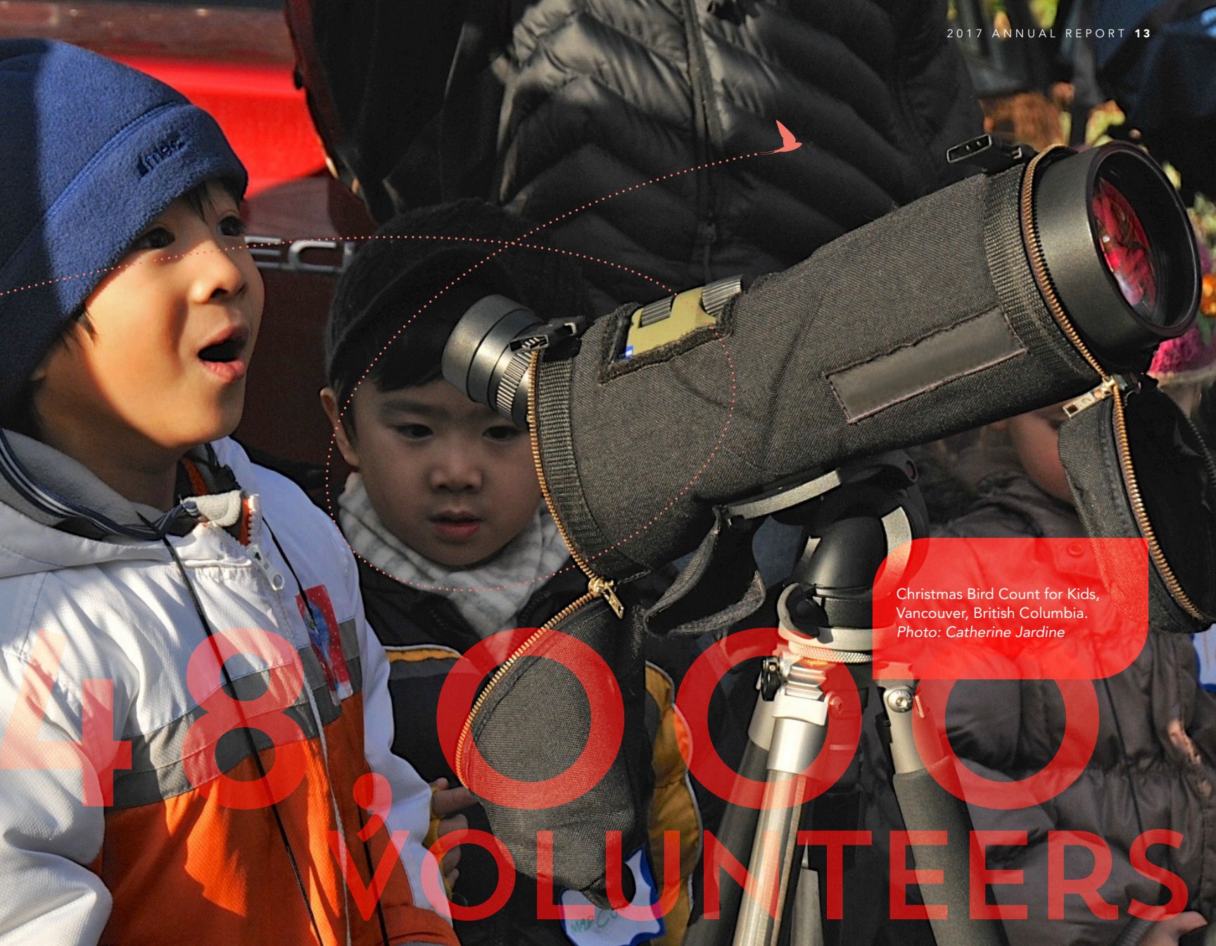
Christmas Bird Count for Kids, Vancouver, British Columbia.