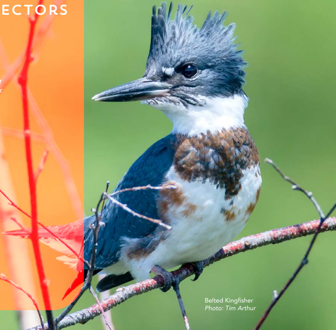
Belted Kingfisher