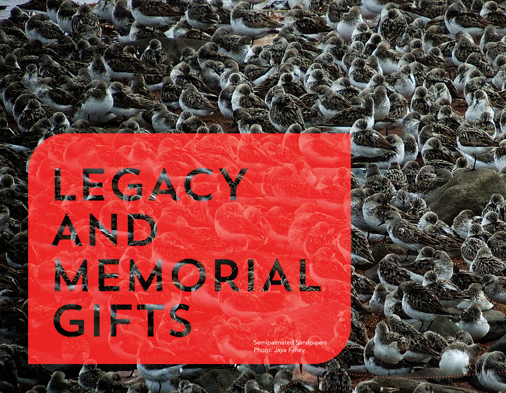
Semipalmated Sandpipers