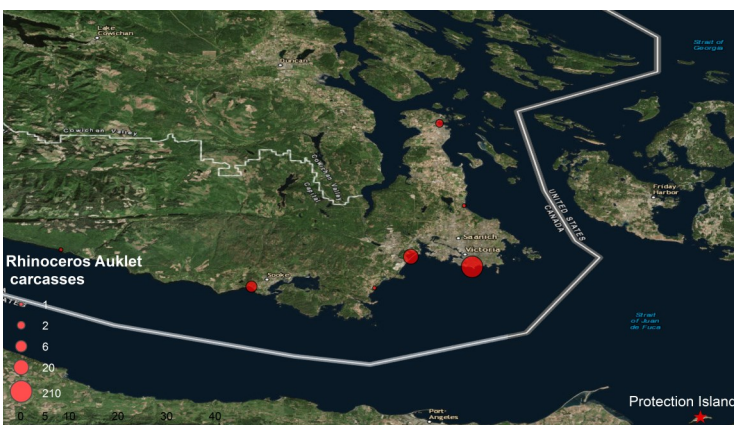
Figure 1 Distribution of Rhinoceros Auklet carcasses reported in Canada from May—September. Carcasses in the US were concentrated around Protection Island and the outer Washington Coast.

A total of 243 birds were reported between May and September, with peak numbers in July and August (figure 1). Ninety-two carcasses were collected, 42 of which were examined by the BC Ministry of Agriculture's Animal Health Centre. Results from the post-mortem exams indicate that the birds were in fair body condition and died of a bacterial infection. In Canada, the response to this event was truly a collaborative effort between volunteers, the Canadian Wildlife Service, Ministry of Forests, Lands, and Natural Resource Operations, Wild ARC, and the BC Ministry of Agriculture's Animal Health Centre.