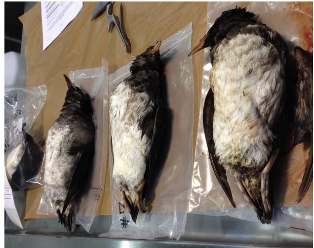
Forty-two Rhinoceros Auklets were examined by veterinary pathologists at the BC Ministry of Agriculture's Animal Health Centre.

Across the border, the Coastal and Seabird Survey Team (COASST) also reported an increase in the number of Rhinoceros Auklet carcasses washing ashore. Of the 548 carcasses reported in the US, most were found on beaches around Protection Island (Washington), where an estimated 72,000 Rhinoceros Auklets breed. Carcasses examined in the US were classified as emaciated and showed similar bacterial infections.