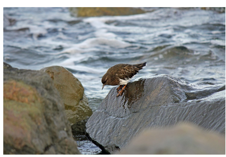
Black Turnstone during Beached Bird Survey, Ross Fisher