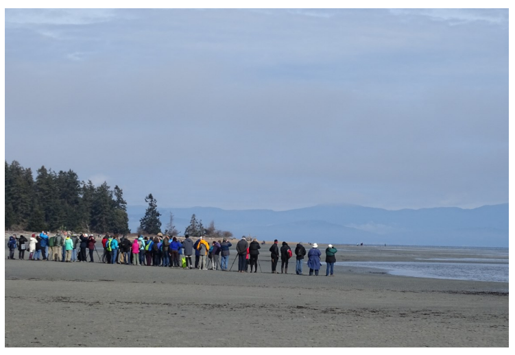
Parksville Training Workshop, March 2019, G. Sorenson