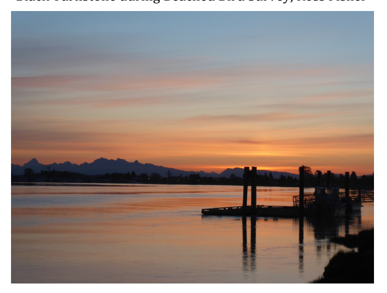
Sunrise at Canoe Pass, Delta, BC, James Casey

The Beached Bird and Coastal Waterbird Surveys of Birds Canada are supported by: