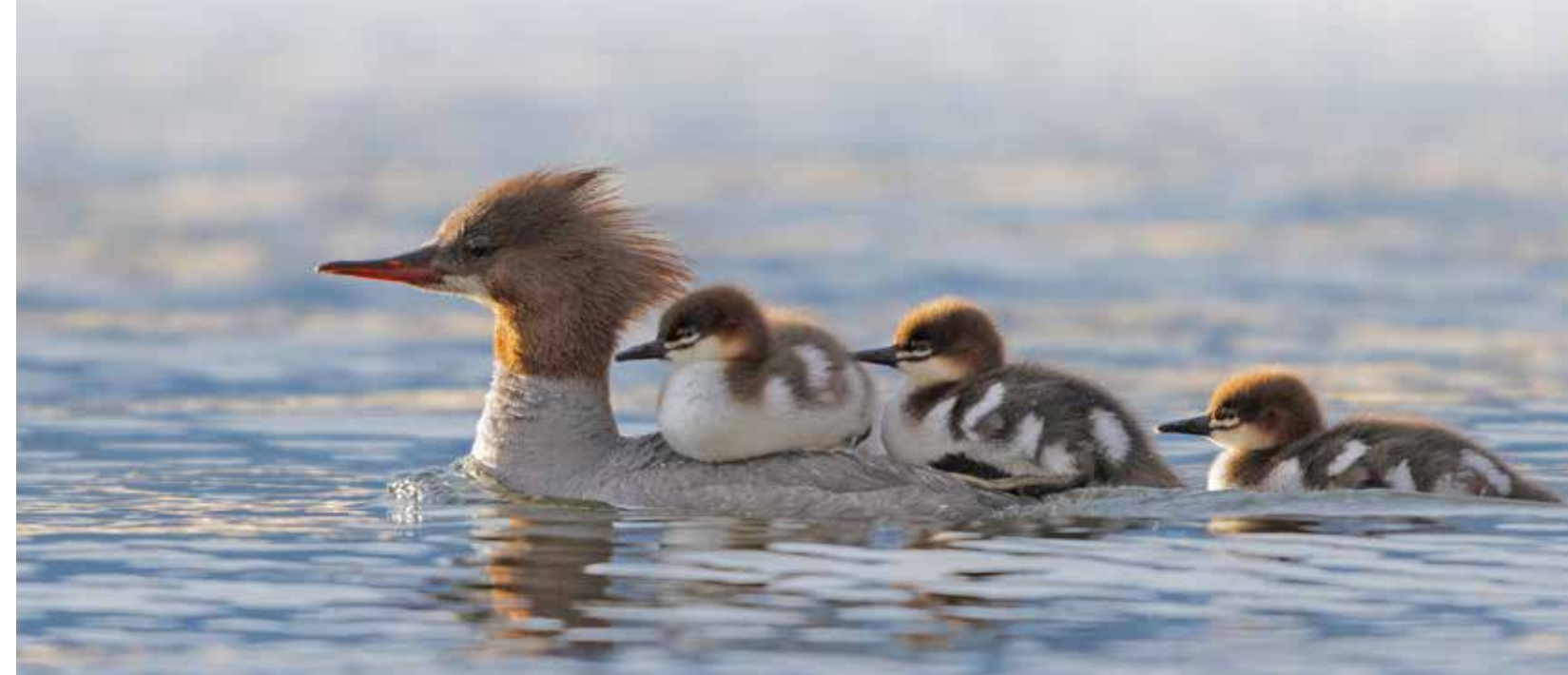
Common Merganser; Breeding evidence - (FY) Recently Fledged Young (nidicolous species, whose young are raised in a nest) or downy young (nidifugous species, whose young leave the nest soon after hatching) incapable of sustained flight. Grands Harles. Code d'indice de nidification FY - Jeune ayant récemment quitté le nid (espèces nidicoles) ou jeune en duvet (espèces nidifuges) incapable d'un vol soutenu.