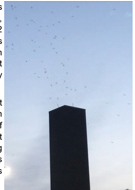
Chimney Swifts entering chimney