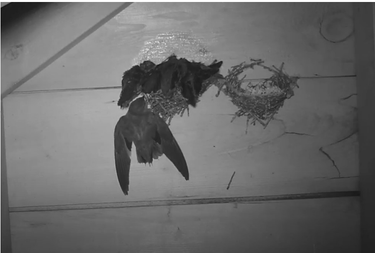
Trail camera footage of a Chimney Swift nest in southern Ontario

Although not directly related to SwiftWatch, in 2021 we successfully gathered video footage of the entire breeding period from a trail camera in a barn with an active Chimney Swift nest. The footage shows nest building, egg laying, incubation, nestling feeding, fledging, and parent interactions. The footage is being compiled as part of an educational video, with the intention of being shared with schools, interested groups, and the general public. It will be available on Birds Canada's website, and our YouTube channel ( https://www.youtube.com/user/BirdStudiesCanada ) - so stay tuned!